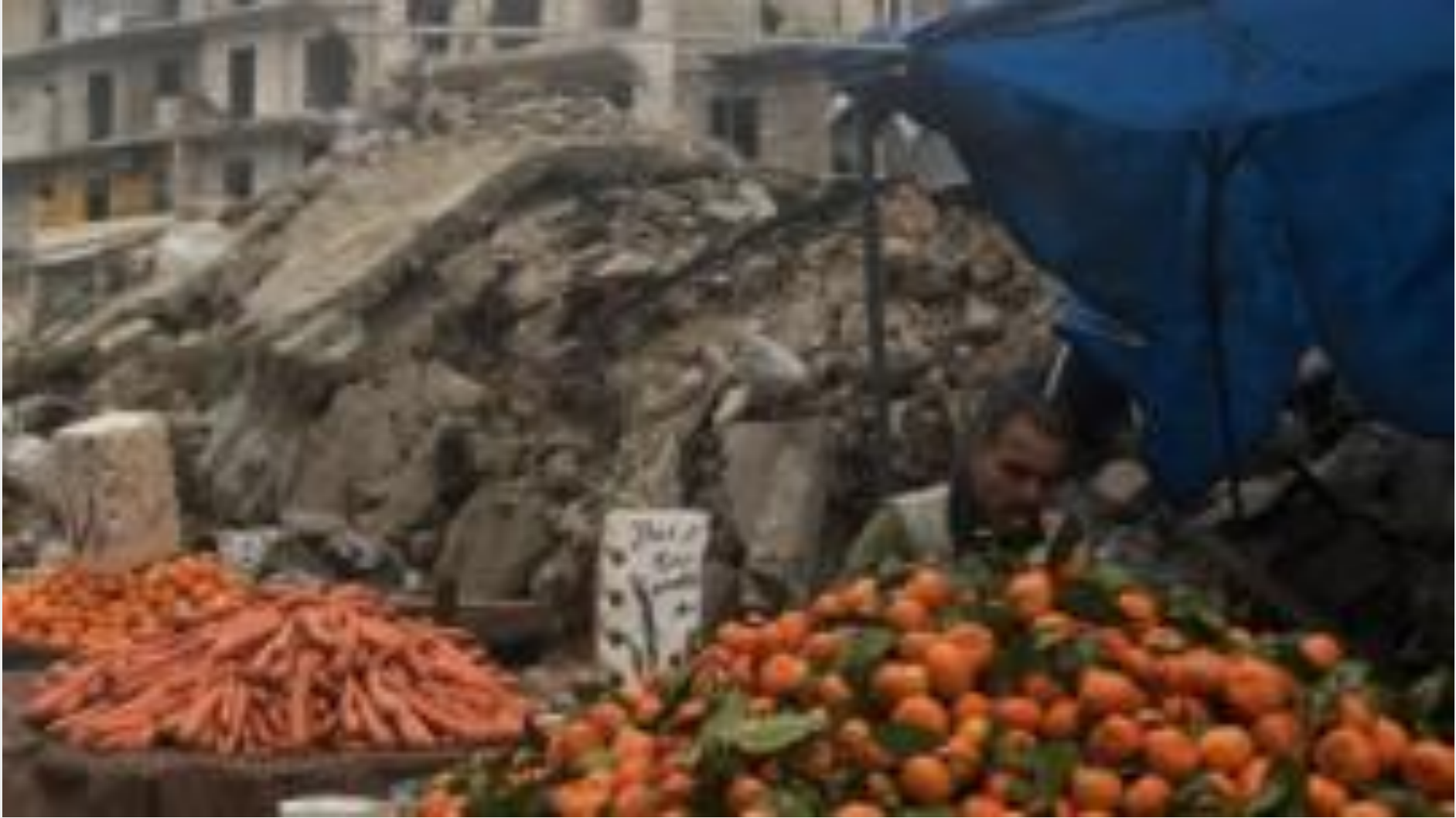
Rebuilding Aleppo: Beyond the conflict