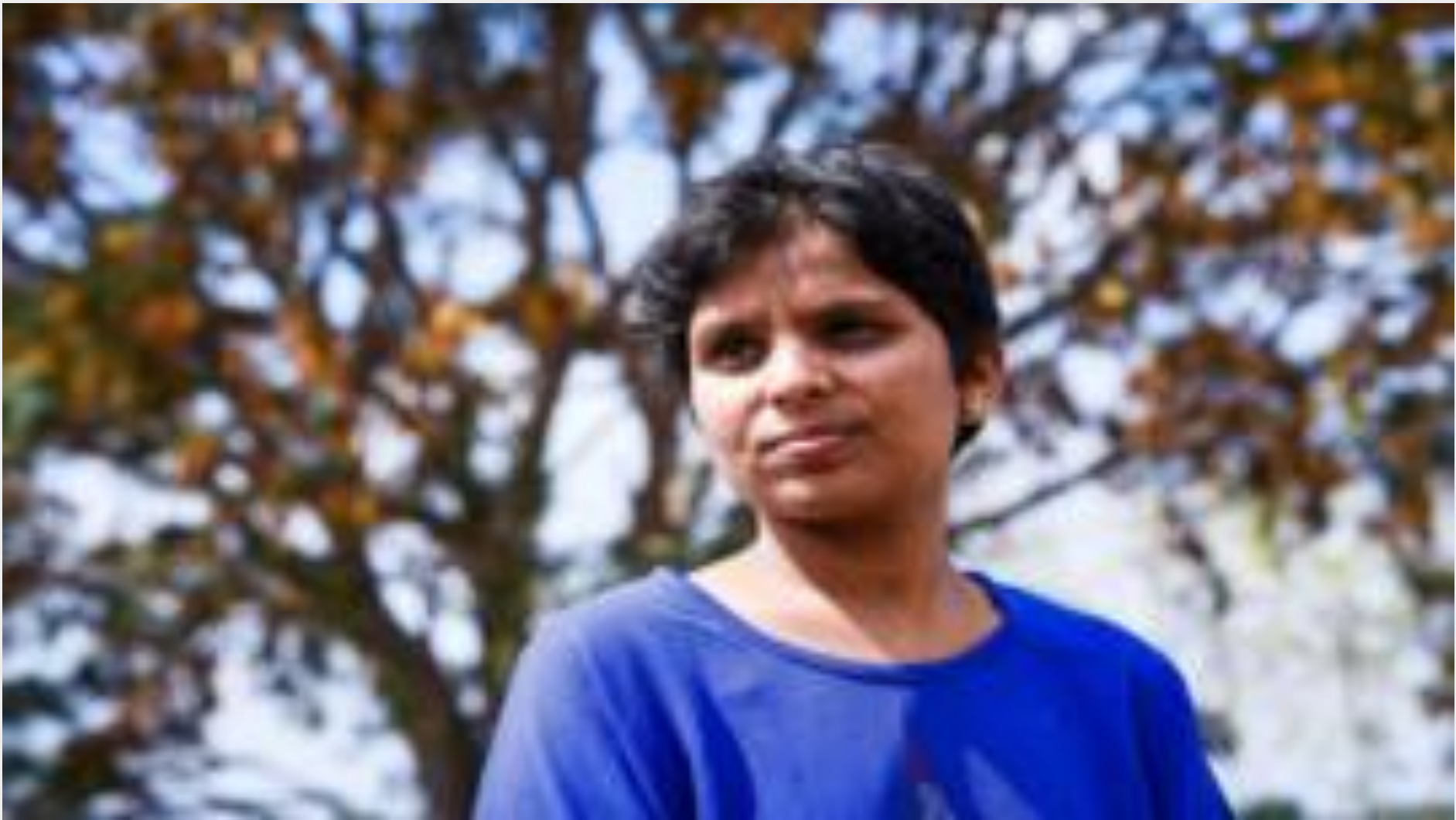
'My husband was murdered for loving me'