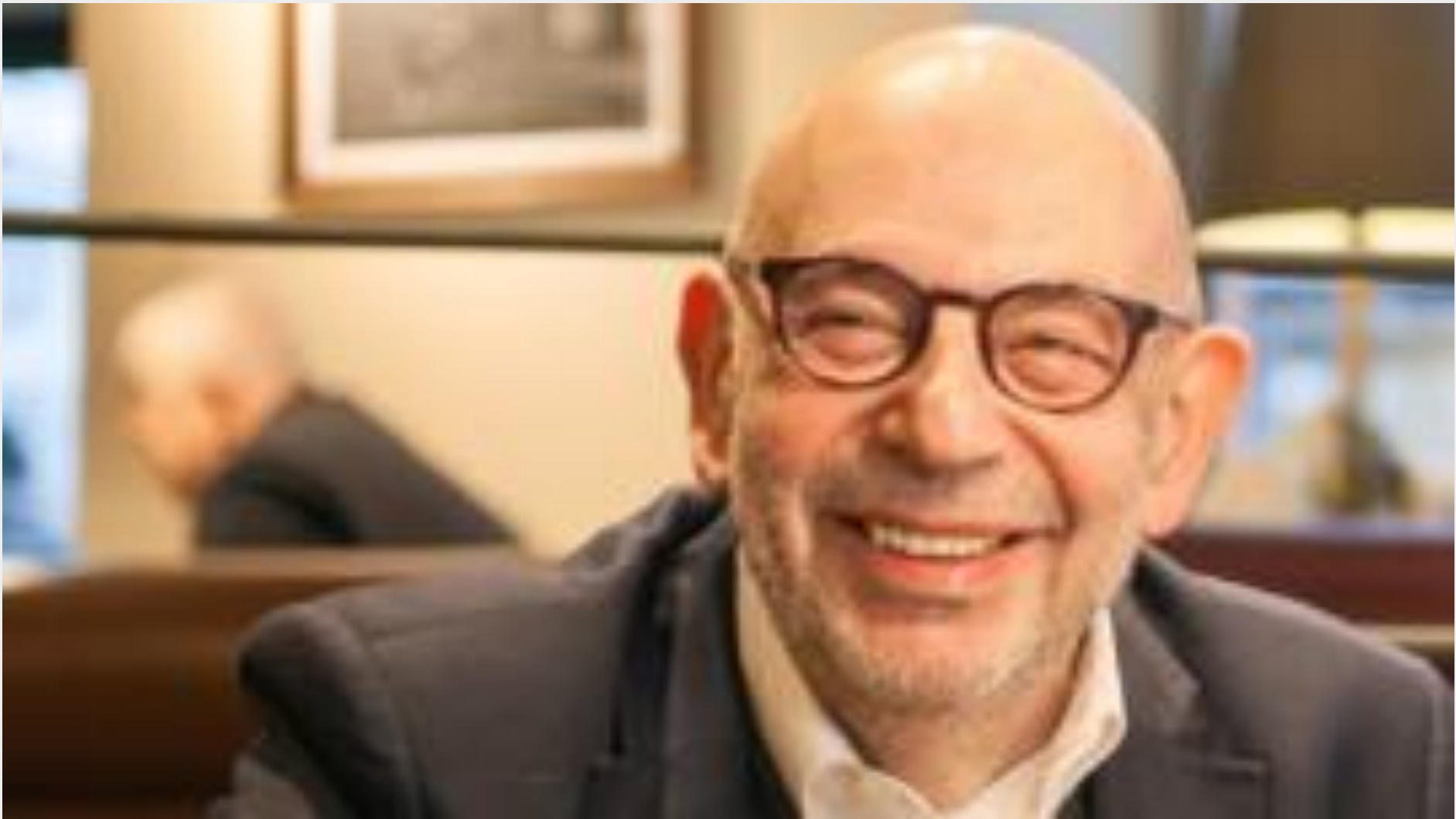
The businessman exiled for being Jewish