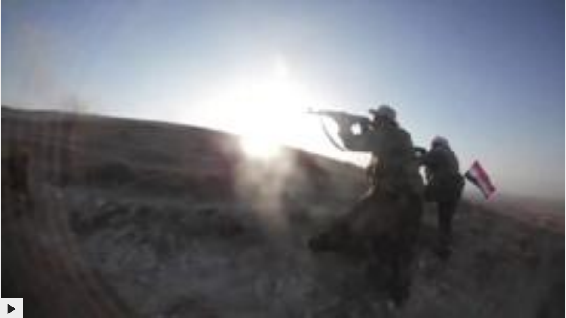
▶ The pictures that show IS still plagues Iraq