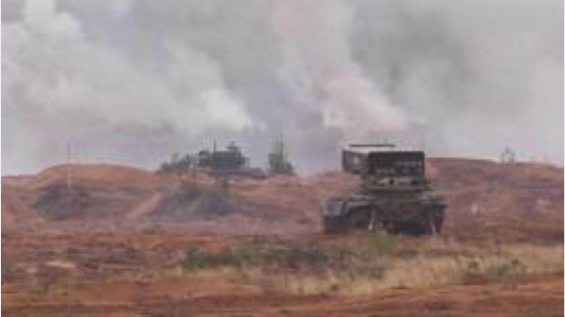
In a hurry? Here's what you need to know this morning