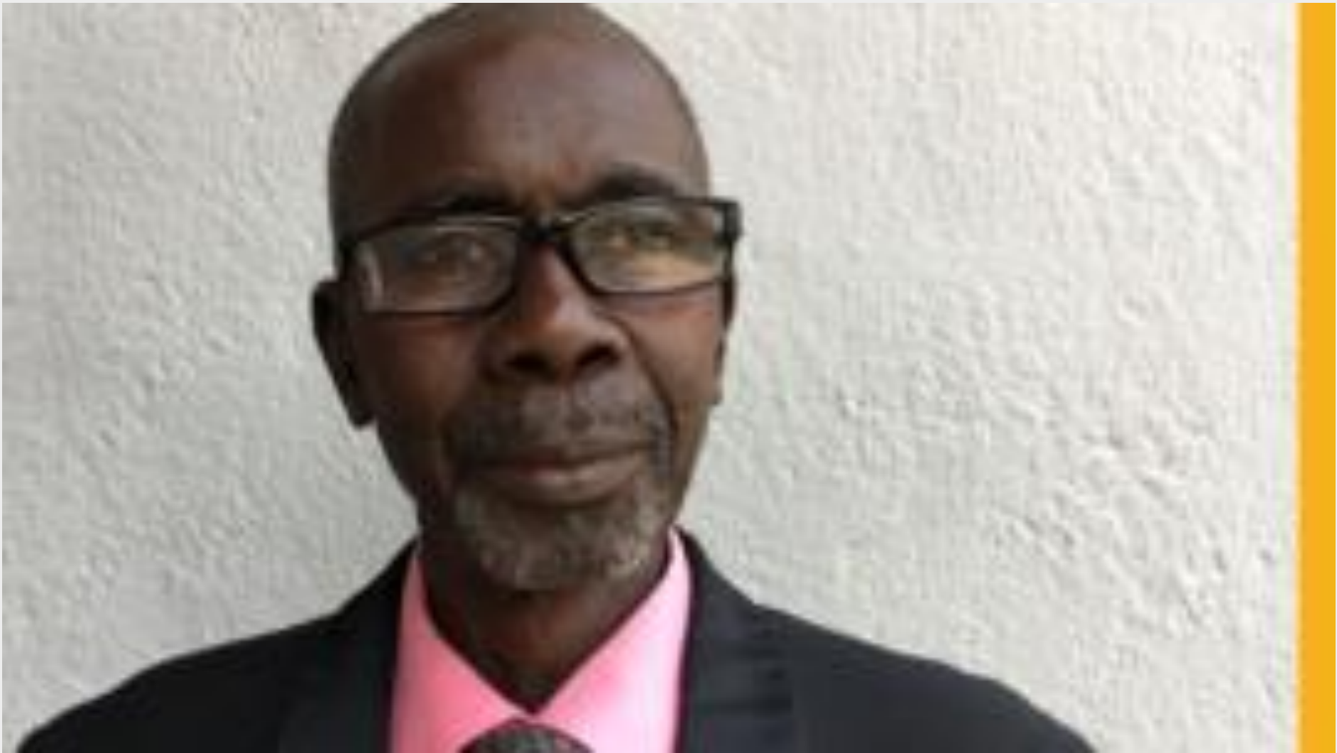
The president forced me to take his herbal HIV 'cure'