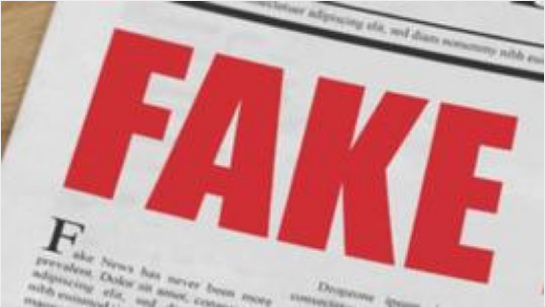
The (almost) complete history of 'fake news'